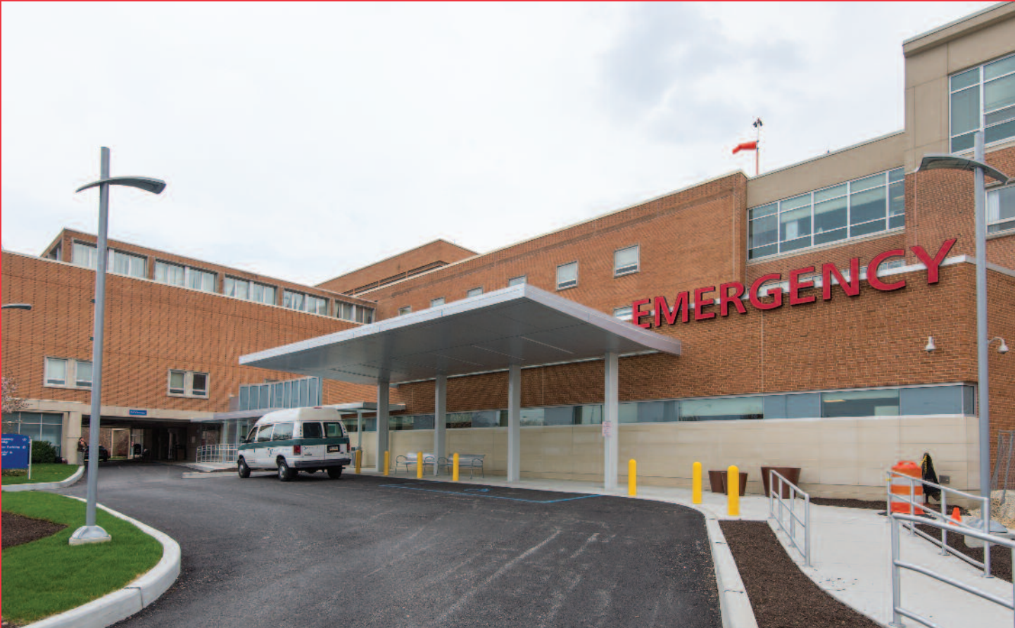
OPEN! Emergency Department facade features new sign and entrance.