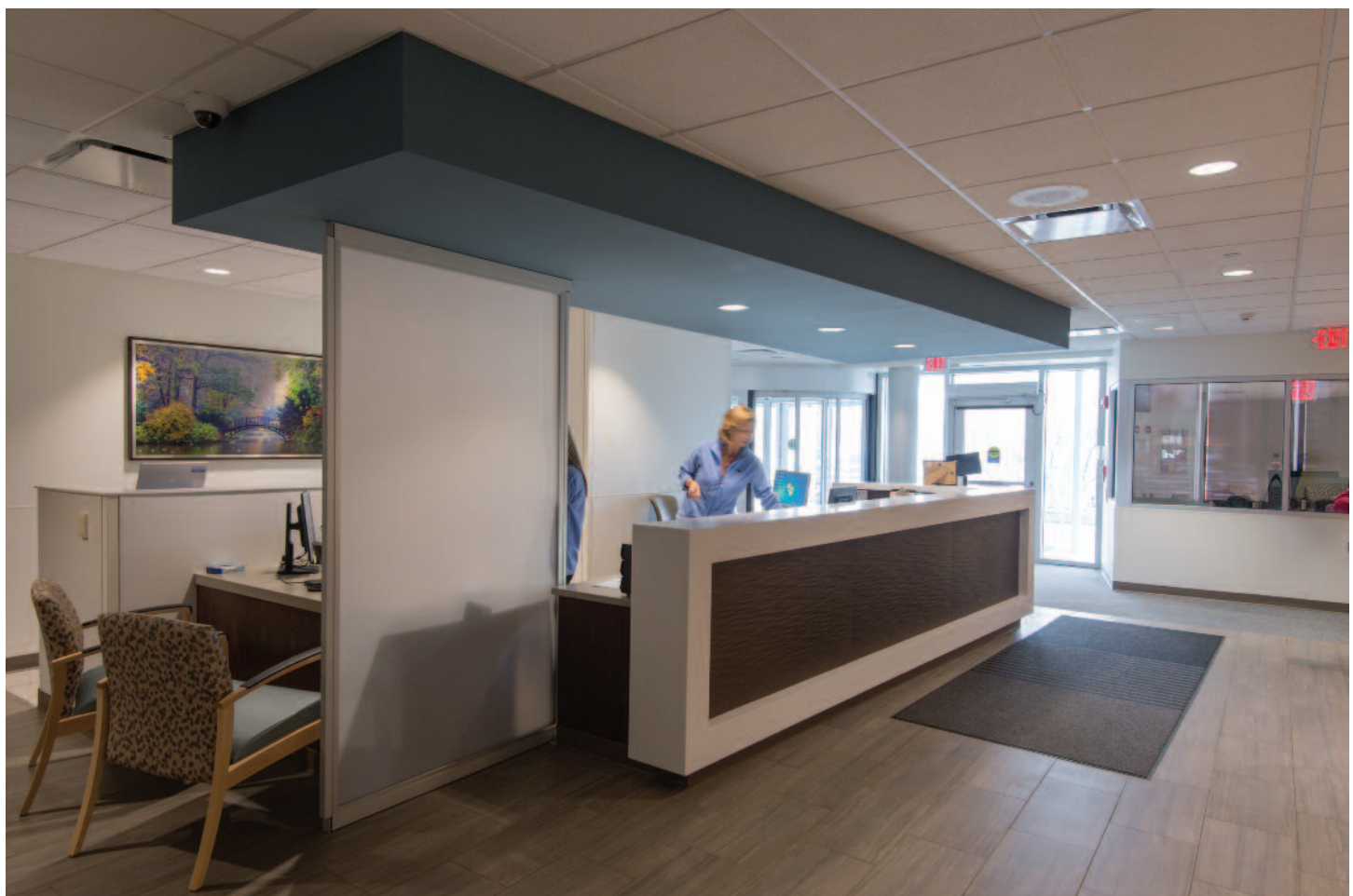
New ED waiting room welcomes patients with modern and comfortable amenities.