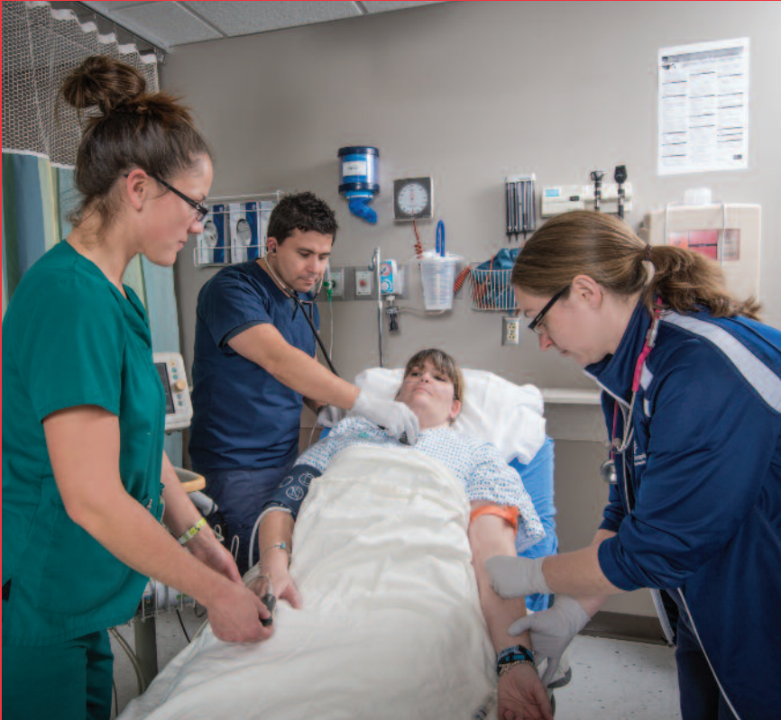
ED staff meet and care for a Rapid Evaluation Unit patient as a team.