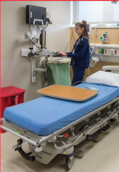
ED nurse readies one of the new patient rooms in the Rapid Evaluation Unit.