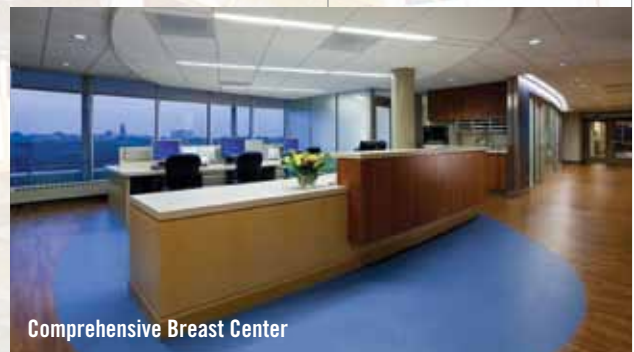
Comprehensive Breast Center

16 All-new Gastrointestinal Interventional Endoscopy Suite enabling complex