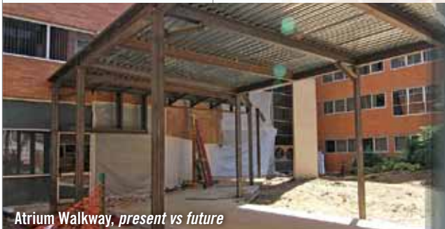
Atrium Walkway, present vs future

5 The Medical Office Building Atrium is under construction to provide a new Atrium Café, a new escalator, and expanded seating in this sun-filled space.