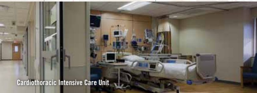
Cardiothoracic Intensive Care Unit

20 Roadway improvements including new turning lanes and light re-timing for easier patient access and egress.