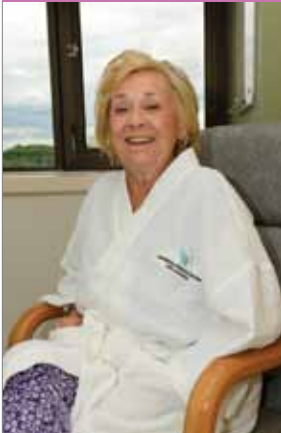
Above: A patient at Lankenau enjoyed her “spa-like” robe during her stay.

A t Lankenau we have a different take on what it means to be a philanthropist. We would be remiss if we considered philanthropy to be merely a transaction of money to a charity. After all, that’s not the whole story of what philanthropy is all about.