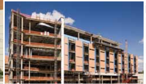
Heart and Vascular Pavilion

Your experience is at the heart of the design for all of the new construction, renovations and upgrades. We know that the small details make the difference between a standard hospital visit and a comfortable, convenient, private place to receive care.