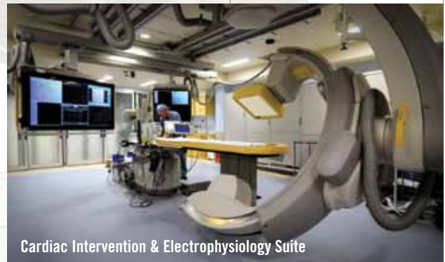
Cardiac Intervention & Electrophysiology Suite