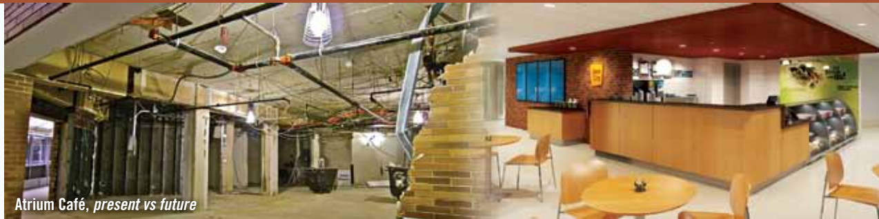
Atrium Café, present vs future