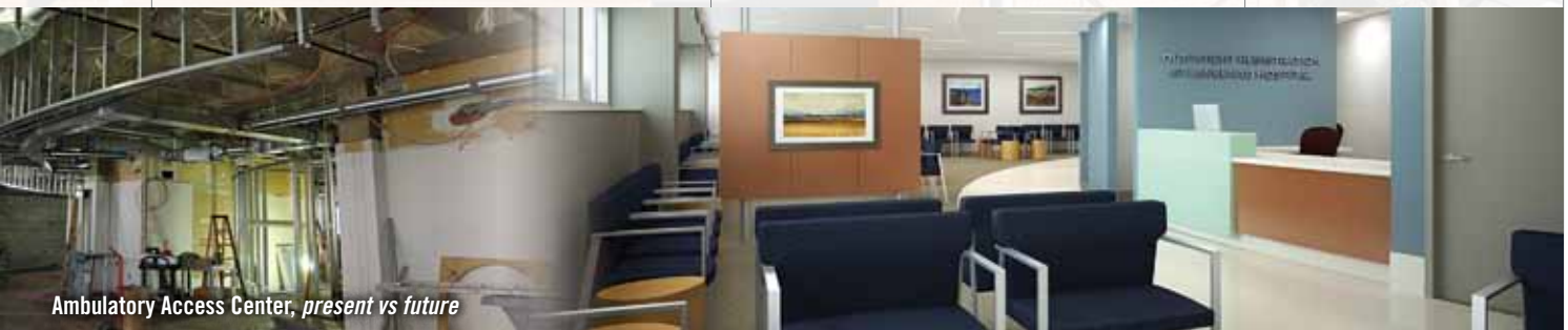
Ambulatory Access Center, present vs future

4 The Ambulatory Access Center will offer one convenient, expanded location for the registration, outpatient laboratory and pre-admission testing departments. This all-new suite will be conveniently accessible from visitor parking garage B.